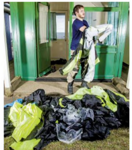
▲ "That's 18 suits tested - time for a shower..."

If you think of motorcycle clothing as a layering system, then a waterproof oversuit can be for all year round, not just for summer. Worn over an armoured layer, and other layers for comfort and temperature regulation, an oversuit can provide all the waterproofing you need. Just make sure you buy one that's big enough to go over all those other layers.